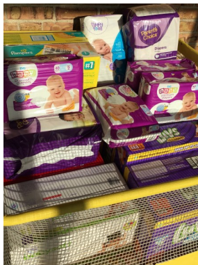
TEAM ZION needs your help!

Can ZION LUTHERAN donate the most diapers again this year? We've been the Champions the last 2 years so let's see if we can make it 3 years in a row!!